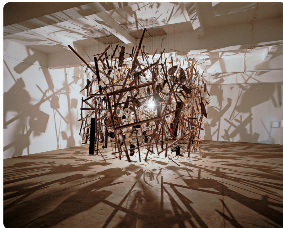
Cold Dark Matter: An Exploded View by Cornelia Parker, 1991