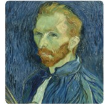
Self-portrait, Vincent van Gogh, 1889

A self-portrait is a portrait that an artist produces of themselves. Vincent van Gogh painted many self-portraits.