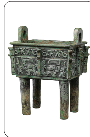
Bronze ritual vessel, c1600–c1046 BC