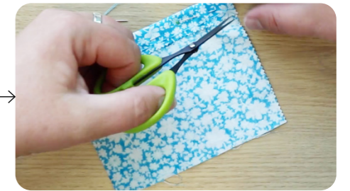
Tie a knot at the end of the hem and cut the thread. Iron along the crease to flatten the hem.