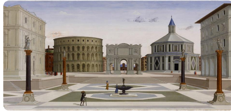
The Ideal City by Fra Carnevale, c1480–1484

Urban landscapes are drawings of towns and cities shaped by the people and buildings found there. Different atmospheres are created using bright, dark or muted colours and sharp or blurry lines.