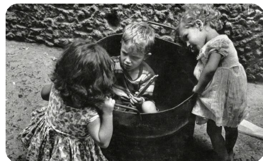
Naples, Italy – Children, 1961

Abstract forms distort their subjects by using simplified shapes and patterns.