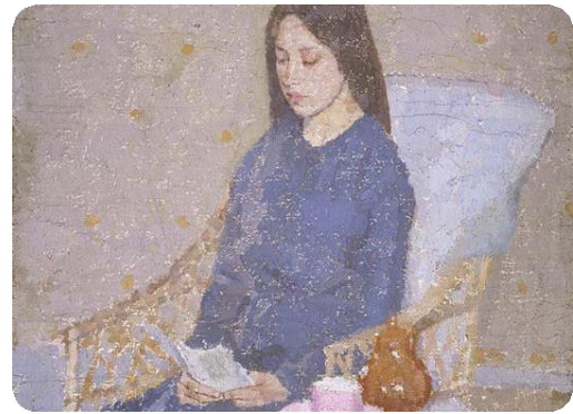
The Convalescent by Gwen John, c1923

The artist's interest in the human form has endured for thousands of years. Representations of human figures have been discovered from prehistoric cave paintings right through history until the present day. These figures can inform us about the cultural, religious or everyday life of different societies. Pictures of human figures can be figurative, abstract or photographed.