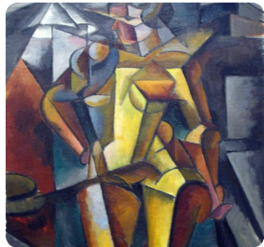
The Model by Lyubov Popova, 1913

Figurative forms portray their subjects, which are generally posed, as accurately as possible.