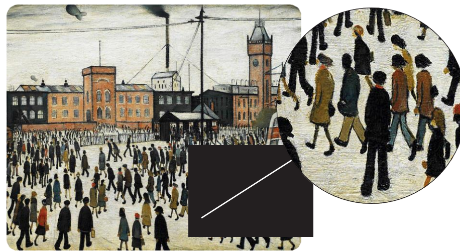
Going to Work by LS Lowry, 1959